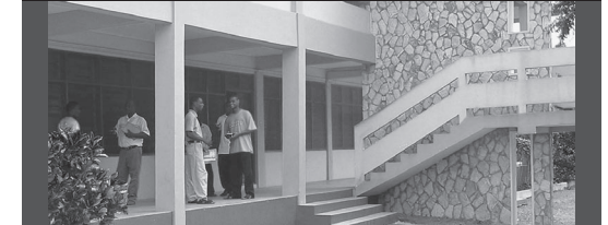
STUDENTS OUTSIDE THE EDUCATION BUILDING