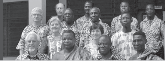
BOARD OF GOVERNORS STANDING WITH VISITORS