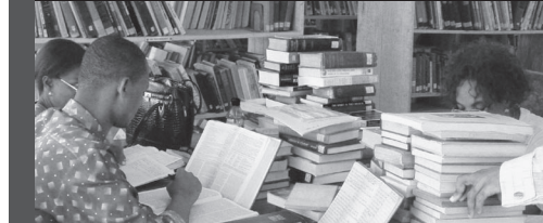
STUDENTS STUDY IN THE LIBRARY

GOD'S VICTORY In the final victory of God over Satan and all evil and the establishment of his perfect kingdom in the new heaven and new earth.