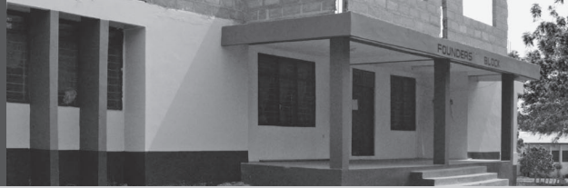
PARTIALLY COMPLETED MEN'S DORMITORY