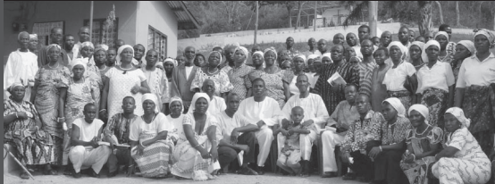
EXTENSION TRAINING AT A RURAL CONFERENCE